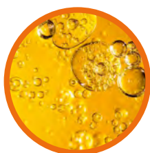
20L RECYCLED VEGETABLE OIL