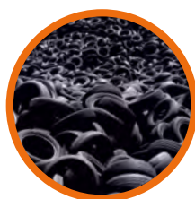
2 MICRONIZED TYRES*