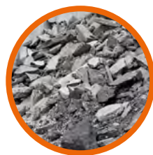
30% RECYCLED ASPHALT*

Over the entire product life cycle, Rapid Asphalt® produces 10 times less CO 2 emissions than similar products.