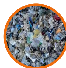
100% RECYCLED PLASTIC BAG

For a 3 cm coat, 1700 tires would be recycled per km of road!